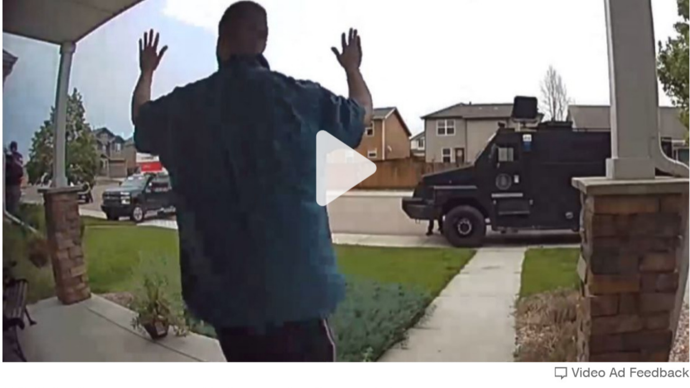
Club Q shooting suspect was previously arrested, police revealed 03:45

(CNN) — After allegedly killing five people and injuring more than a dozen others, the 22-year-old suspect in a mass shooting at an LGBTQ nightclub in Colorado Springs, Colorado, apologized to medical staff after being taken into custody, according to a court document unsealed Wednesday.