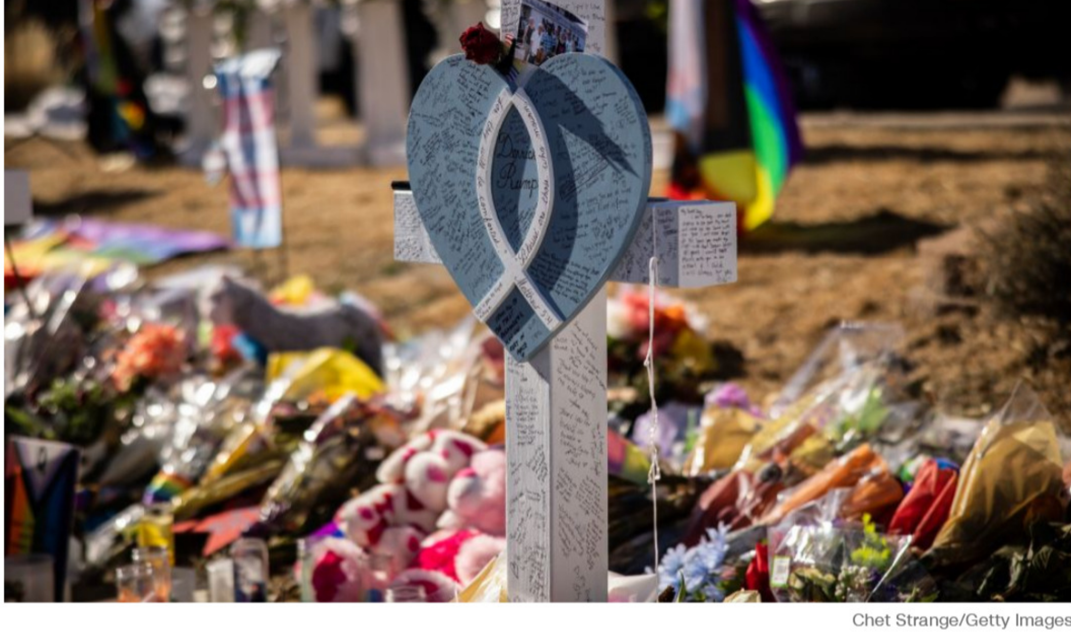
A memorial stands outside Club Q on November 22, 2022, in Colorado Springs, Colorado.