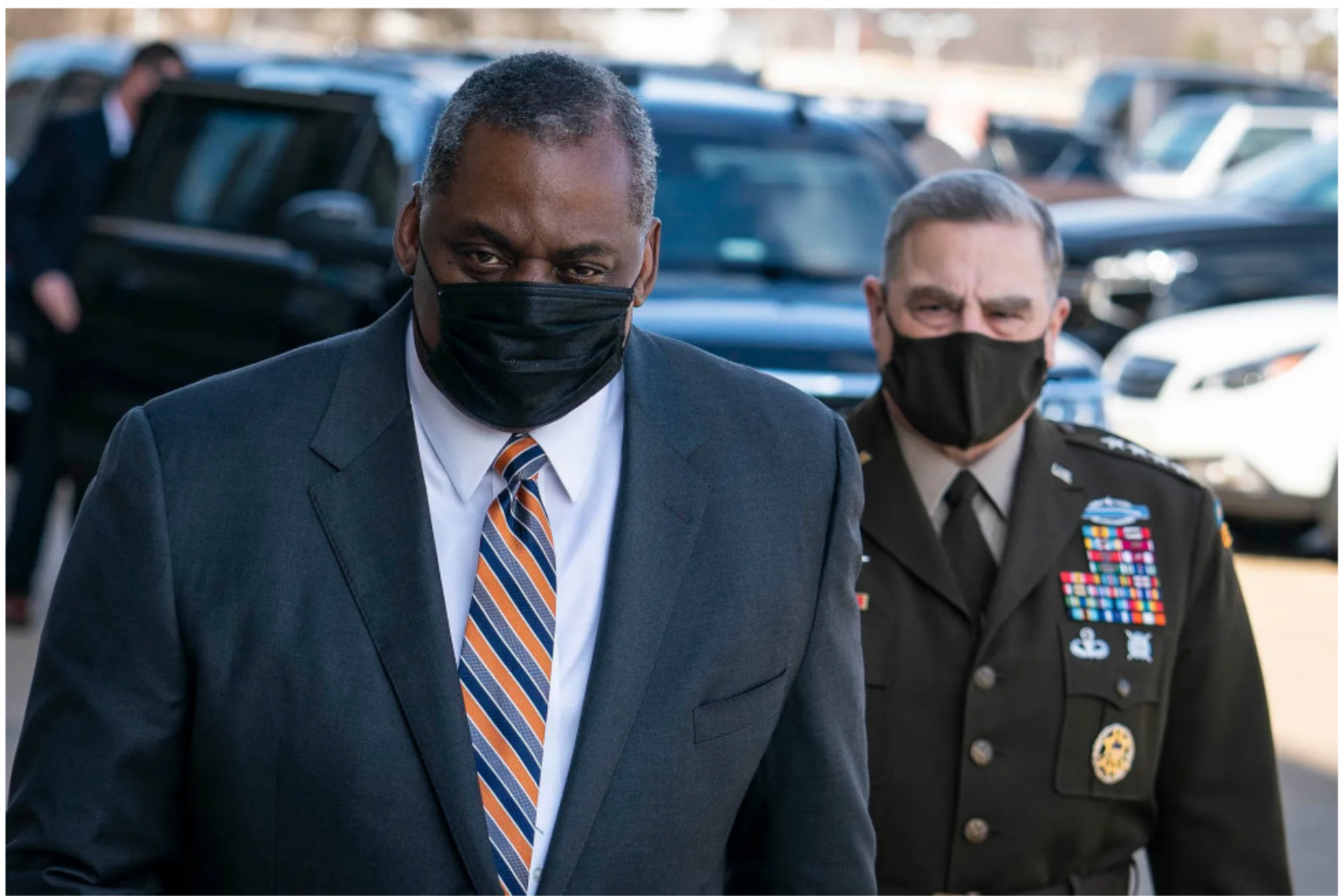
Lloyd Austin arrives at the Pentagon for his first day as Defense secretary in January.

Last month’s attack on Capitol Hill intensified concerns about extremism within the United States military. Though the number of current or former members of the armed forces who participated in the deadly MAGA riot is unknown , an NPR analysis in late January found that as many as one in five of those charged in the wake of the insurrection had a record of military service. During his confirmation hearing for the role of Joe Biden ’s secretary of Defense, Lloyd Austin vowed to root out white supremacy and right-wing radicalism in the ranks, though he provided little detail as to how that would be accomplished. “The job of the Department of Defense is to keep America safe from our enemies,” he said . “But we can’t do that if some of those enemies lie within our own ranks.”